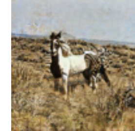
Q_{12}(w, f) \rightarrow P_{0.5}(w, f)