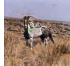
P_{0.5}(w) \rightarrow Q_{12}(w, f)