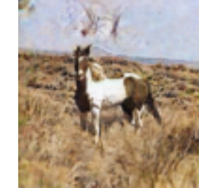
P_{0.5}(w, f) \rightarrow Q_{12}(w, f)